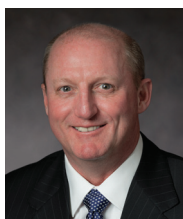
GREGORY E. ABEL Chairman, President and CEO